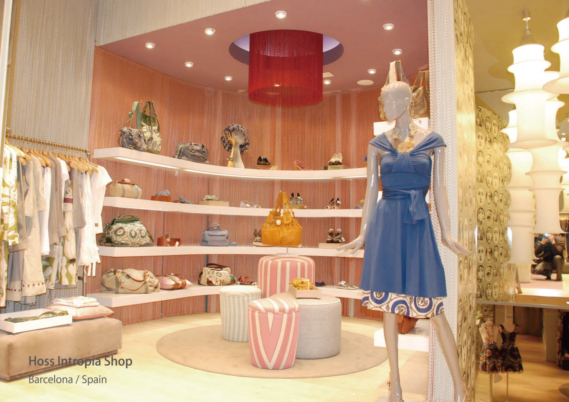
Hoss Intropia Shop Barcelona / Spain