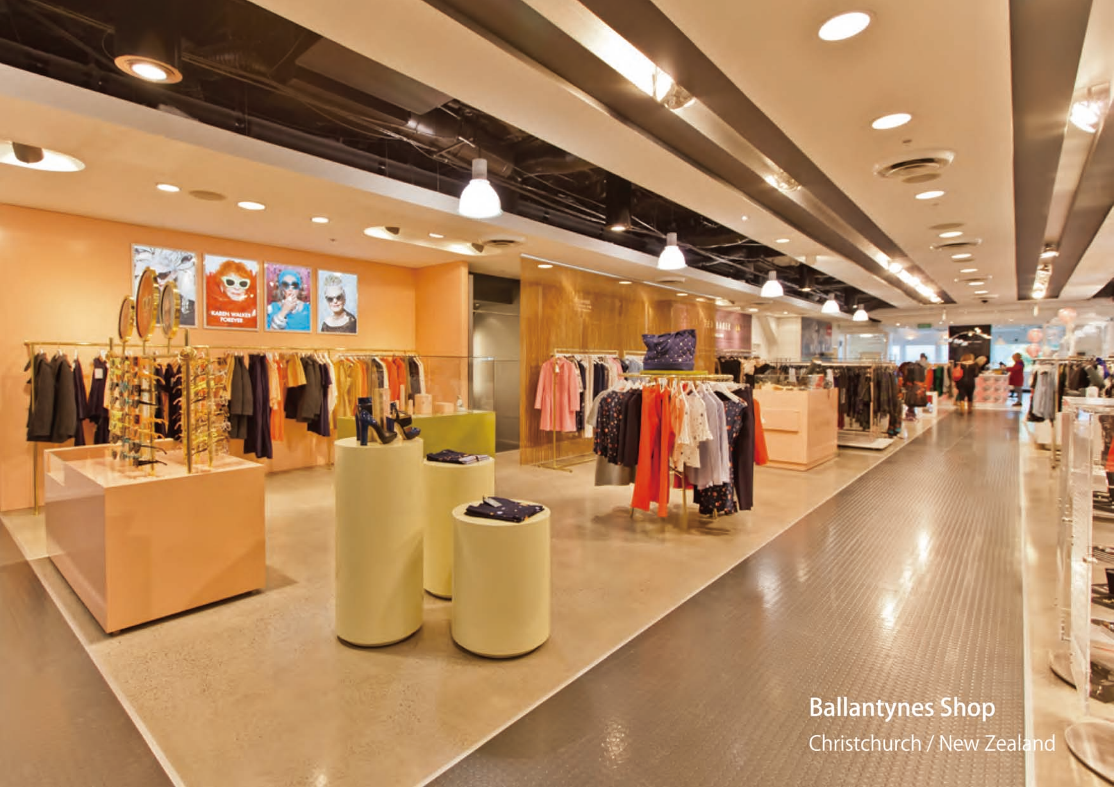
Ballantynes Shop Christchurch / New Zealand